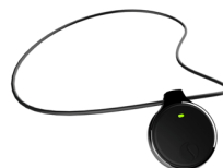
Safety Button and pendant